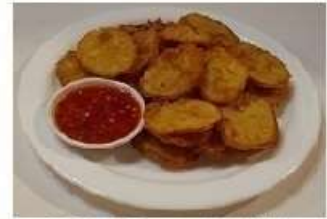
2 Fried Potato (Bahjia)