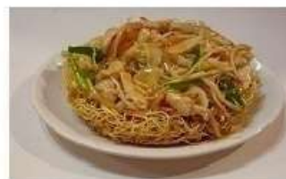
169 Crispy Cantonese Noodles