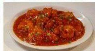
123 Garlic Prawn