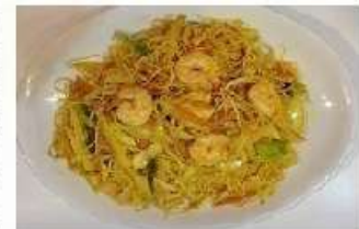
203 Singapore Vermicelli