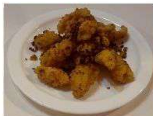
112 House Squid