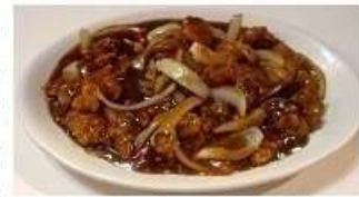
40 Chili Chicken