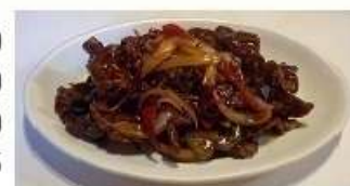
73 Crispy Beef