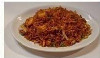
196 Manchurian Fried Rice