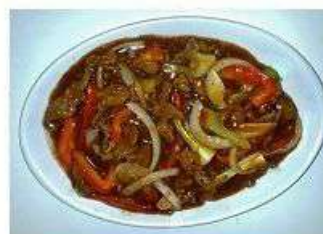
95 House Lamb