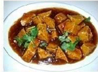
129 Manchurian Tofu