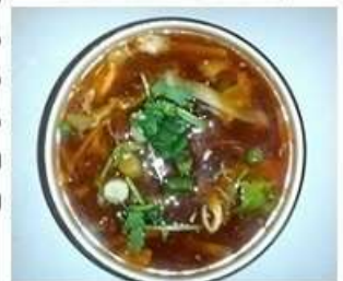
30 Manchow soup