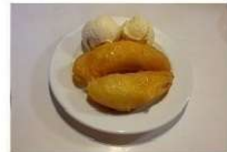
211 Fried Banana with Ice Cream