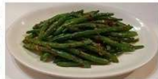
141 Spicy Green Beans