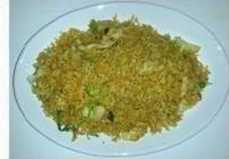
191 Masala Rice