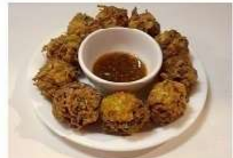
16 Chili House Veggie Pakora's