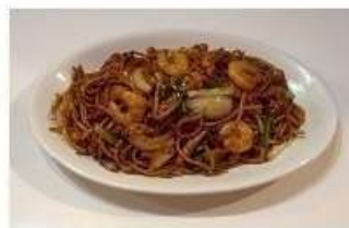
165 Hakka Chow Mein