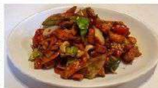
85 Kung Pao Chicken