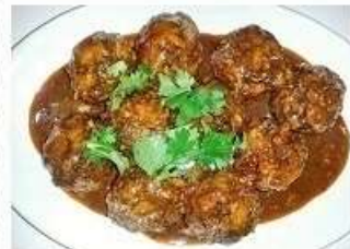
151 Manchurian Veggie Balls