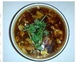
29 Hot & Sour Soup