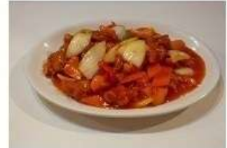
B4. Sweet & Sour Chicken