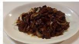
59 Spicy Ginger & Garlic Beef