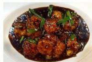
122 Mongolian Prawns