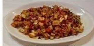
132 Dai Ching Tofu