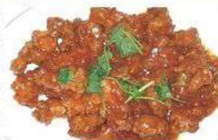
90 Mambo Chicken