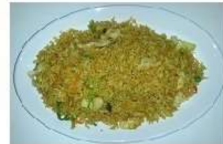
B22. Masala Fried Rice