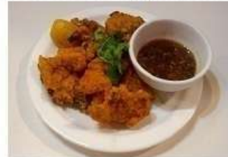
17 Fish Pakora's