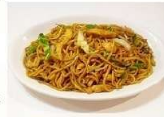
B27. Chicken Chow Mein