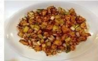
44 Dai Ching Chicken