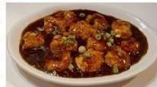
55 Manchurian Prawns