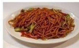
170 Manchurian Chow Mein