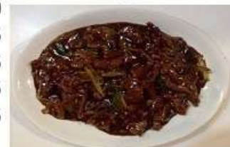
75 Mongolian Beef