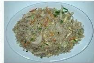
188 House Style Fried Rice